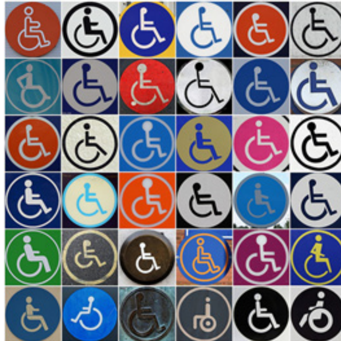
Figure 2: Think pink, yellow, black and white, queer, going left of going right. Challenge your stereotypical image of a person in a wheelchair.