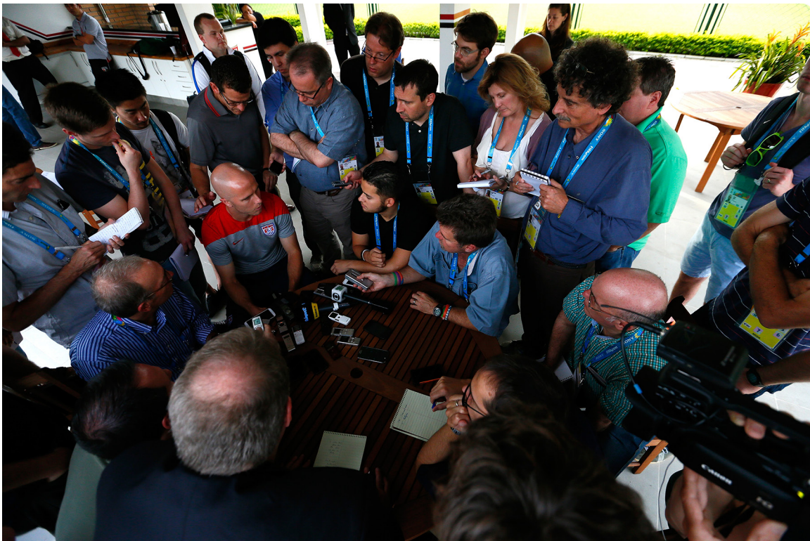
Michael Bradley of the United States speaks to the media during training at Sao Paulo FC on June 28, 2014 in Sao Paulo, Brazil.

“You had a coach who was invested not only in our performance, but in also making sure that we were citizens and he was also a good role model and citizen for the Olympic Training Center.”