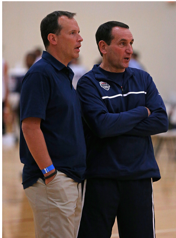
Head coach Mike Krzyzewski of the USA Basketball National team (R), talks with head coach Chris Collins of Northwestern University during a USA basketball training session at Quest MultiSport Complex on August 15, 2014 in Chicago, Illinois.

Haidt, J (2006). The Happiness Hypothesis: Finding Modern Truth in Ancient Wisdom . New York: Basic Books.