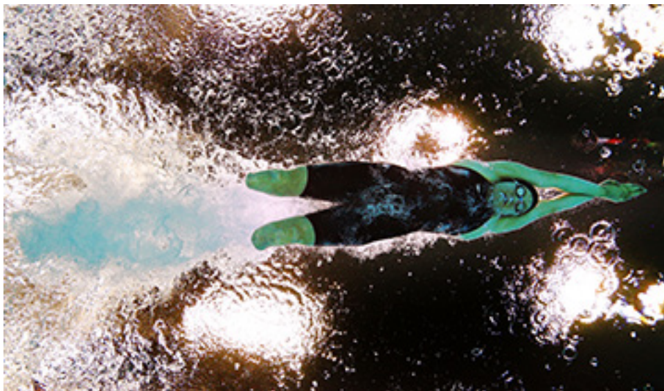
Jessica Long of the United States competes in the Women's 400m Freestyle - S8 Final on day 2 of the London 2012 Paralympic Games at Aquatics Centre on August 31, 2012 in London, England.