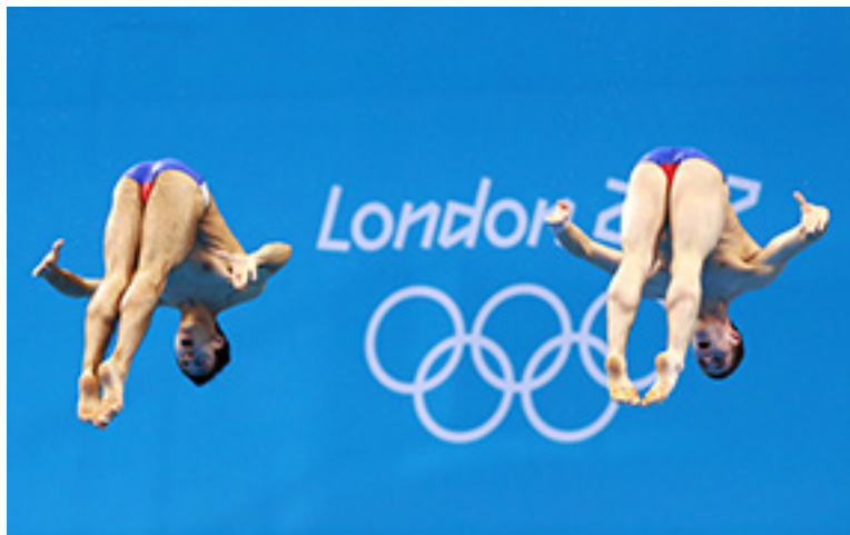
Nicholas Mccrory and David Boudia (R) of the United States compete during the Men’s Synchronised 10m Platform Diving on Day 3 of the London 2012 Olympic Games at the Aquatics Centre on July 30, 2012 in London, England.