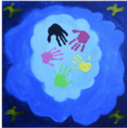
Figure 1: "Relatedness is important across boundaries. No matter color, form or looks – we will support each other and stand united." Relatedness described by Paralympic athletes.

and mindfulness. After each group reached an understanding of the keyword, they were asked to write a definition. In the next step, each of the 17 groups was asked to express the keyword in a painting as a collaborative effort. Figure 1 is chosen as one example out of the total of 17 paintings accomplished during the exercise.