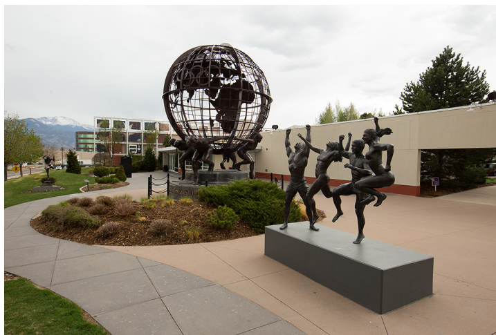
General view of the visitor center at the United States Olympic Training Center in Colorado Springs, Colorado.

While not every athlete who spends time at the training center will go on to win Olympic gold medals, every athlete has the chance to flourish in this environment. The coach can be a great catalyst in this process. As one outcome of the study, the research team prepared a checklist that the resident coach can use to guide his or her efforts to positively impact the developmental trajectory of the athlete at the OTC. Please find a coach checklist and an athlete checklist as a resource to this article (Resource 1 and 2).