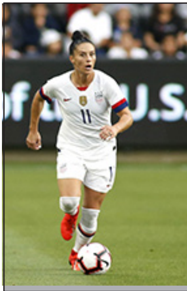
Belgium v United States LOS ANGELES, CALIFORNIA - APRIL 07: Ali Krieger #11 of United States Women's National Team takes the ball down the field during a game against the Belgian Women's National Team at Banc of California Stadium on April 07, 2019 in Los Angeles, California.