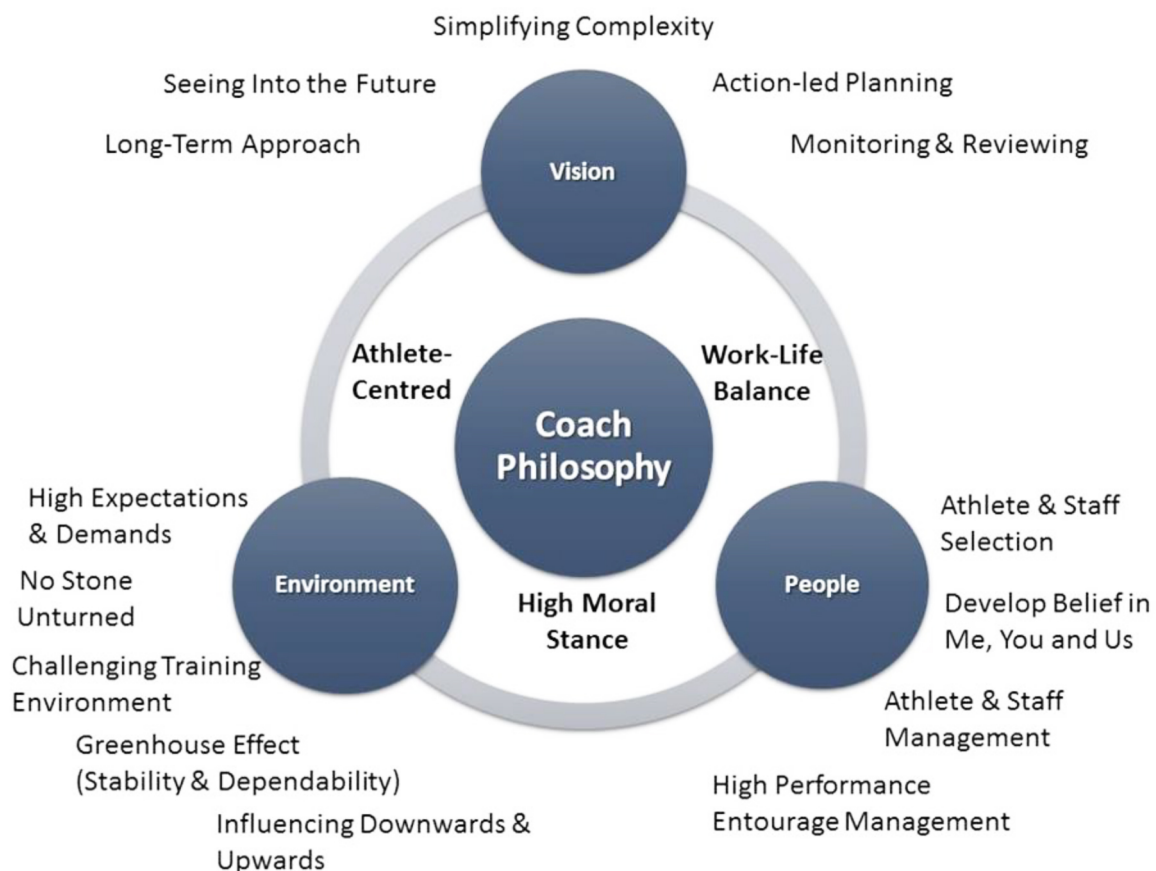
Figure 1 — Serial Winning Coaches Day-to-Day Practice Framework

Coaches and athletes felt that the SWC's practices were anchored upon a very clear philosophical standpoint (their goals, values and beliefs), which provided them with a strong sense of purpose and direction. Within this major